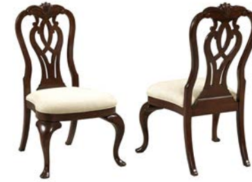
607-636 Hadleigh Side Chair W22-1/8 D24-3/8 H42 Upholstered seat, wood back Fabric: Eastbrook Color: Barley Seat height: 19 Seat depth: 18 Pages 20/21, 22