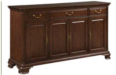
607-850 Hadleigh Buffet W70 D20 H39-1/2 Four doors, three drawers, six adjustable shelves, adjustable levelers, center foot, silverware tray in top center drawer