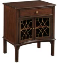
607-421 Hadleigh Bedside Table W25 D18 H29-1/2 One drawer, two doors, adjustable shelf, adjustable levelers Page 8/9, 10