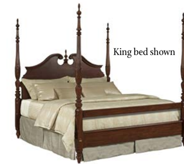
King bed shown