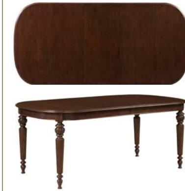
607-760 Hadleigh Oval Dining Table W78 D44 H30 One leaf is self storing, comes with 2 - 20in leaves, comes with removable center leg for extra support

Assembled sizes: W80 D44 H30 - without leaves W100 D44 H30 - with one 20in leaf W120 D44 H30 - with two 20in leaves Pages 24/25, 26/27