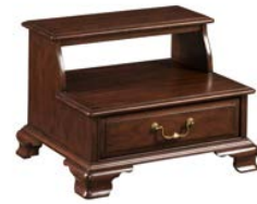
607-481 Hadleigh Bed Steps W22 D18 H16-3/4 One drawer Page 12/13, 14