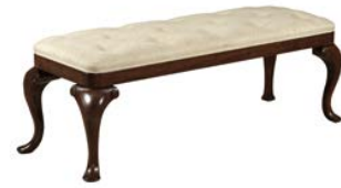
607-480 Hadleigh Bed Bench W52 D17 H19 Fabric: Eastbrook-Barley Page 3, 14