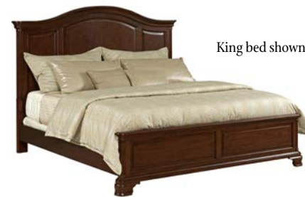
King bed shown