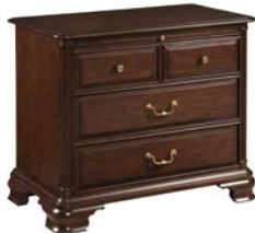
607-422 Hadleigh Bachelors Chest W36 D20 H31-1/2 Four drawers, sliding shelf, adjustable levelers Page 3, 4, 10/11, 12/13