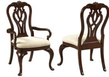
607-637 Hadleigh Arm Chair W25 D24-3/8 H42 Upholstered seat, wood back Fabric: Eastbrook Color: Barley Seat height: 19 Seat depth: 18 Arm height: 25 Pages 20/21, 22