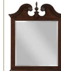
607-030 Hadleigh Vertical Pediment Mirror W35-7/8 D2-5/16 H49-3/8 Beveled mirror Pages 12/13, 15