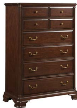
607-215 Hadleigh Drawer Chest W42 D20 H60 Eight drawers, adjustable levelers, drawer dividers in third and fourth drawers from the top Page 16