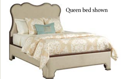
Queen bed shown