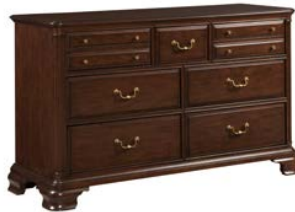
607-131 Hadleigh Bureau W62 D20 H38 Seven drawers, adjustable levelers, top left drawer flips down for components, jewelry tray in top center drawer, cord exit, center foot Page 4/5, 15