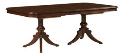
607-744R Hadleigh Double Pedestal Dining Table - Complete W80 D44 H30

consists of: -744 Hadleigh Double Pedestal Dining Table - Top W80 D44 H3-1/2 -B44 Hadleigh Double Pedestal Dining Table - Base W24-1/2 D24-1/2 H26-1/2 One leaf is self storing, comes with 2 - 20in leaves