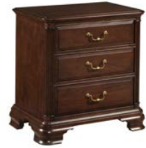
607-420 Hadleigh Nightstand W28 D18 H29-1/2 Three drawers, adjustable levelers Page 2, 4/5, 10