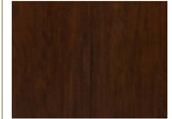
Clear Black Cherry