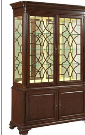
607-830R Hadleigh China - Complete W56 D20 H88

Assembled sizes: W78 D44 H30 - without leaves W98 D44 H30 - with one 20in leaf W118 D44 H30 - with two 20in leaves Pages 20/21