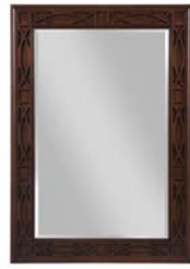
607-032 Hadleigh Decorative Mirror W36 D1-7/8 H51-3/8 Beveled mirror Page 1, 9