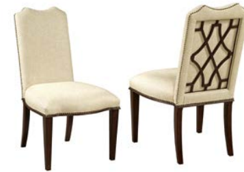
607-622 Hadleigh Upholstered Side Chair W21-3/4 D26-9/16 H41-5/8 Upholstered seat and back Fabric: Eastbrook Color: Barley Seat height: 19 Seat depth: 19 Pages 18, 23, 24/25, 26/27