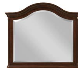
607-020 Hadleigh Arched Landscape Mirror W49 D3-1/4 H42 Beveled mirror Pages 4, 6