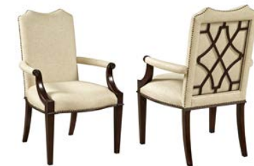
607-623 Hadleigh Upholstered Arm Chair W25-3/8 D26-9/16 H41-5/8 Upholstered seat and back Fabric: Eastbrook Color: Barley Seat height: 19 Seat depth: 19 Arm height: 25-3/16 Pages 18, 23, 24/25, 26/27