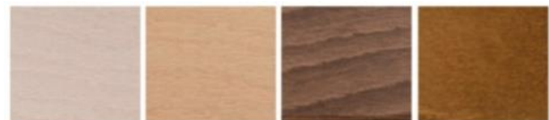
Whitewash Oak Walnut Teak