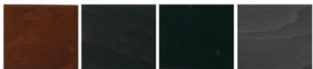
Brown Wenge Black Grey