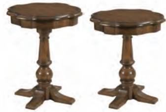
161-918 Byron Round End Table W22 D22 H24/27

3 inch riser block included for adjusting height Pages: 28/29, 30