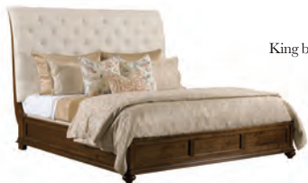
King bed shown