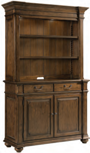
161-830P Monte Buffet Package W56-1/4 D20 H90