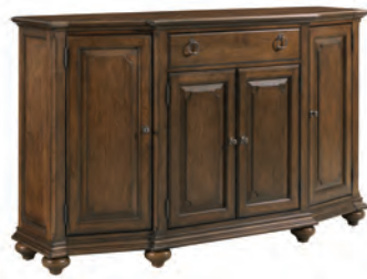
161-850 Damian Master Buffet W68 D20 H42

Four doors, two adjustable wood shelves behind end doors, two adjustable wood shelves behind center doors, six adjustable wood shelves total, brown silverware tray in drawer, adjustable levelers, center foot Pages: 16/17, 22/23, 24