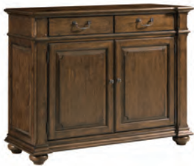
161-830 Monte Buffet W54 D20 H42

Two doors, two drawers, two adjustable wood shelves behind doors, brown silverware tray in top right drawer, brown felt liner in top left drawer, adjustable levelers