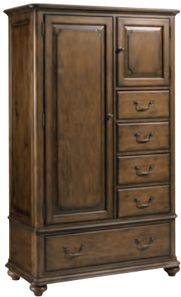
161-291 Witham Gentlemen's Chest W44 D20 H72 Five drawers, two doors, three adjustable wood shelves behind tall door, one adjustable wood shelf behind small door, four adjustable wood shelves total, adjustable levelers Page 1