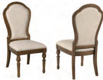
161-622 Kirkman Upholstered Back Side Chair W19 D25-5/8 H42-1/8 Upholstered seat and back Seat height: 19 Seat depth: 18-3/8 Pages: 16/17, 18/19, 22/23