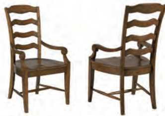
161-637 Renner Arm Chair W23-3/4 D24 H43 Wood seat and back Seat height: 18-1/2 Seat depth: 19 Seat height: 25 Pages: 18/19, 20/21