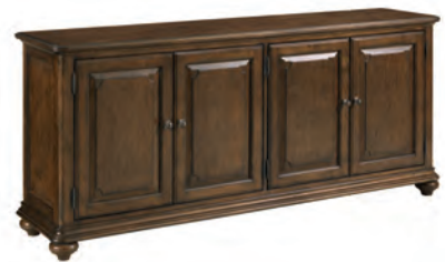
161-586 Morton 76" Entertainment Console W76 D18 H34

Three drawers, center drawer flips down Page: 33