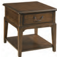
161-915 Washburn End Table W24 D27 H25

Casters, wood shelf, glass top Pages: 27