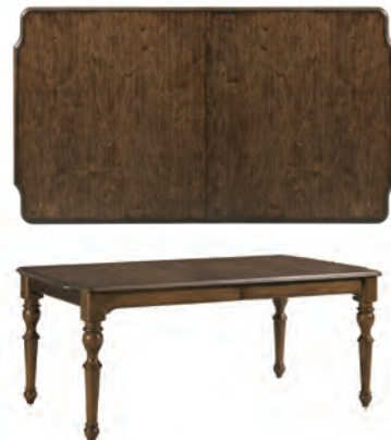
161-744 Corso Leg Table W72 D42 H30 Adjustable levelers, Two 20" leaves

Table Sizes: W54 D54 H30 - without leaf W74 D54 H30 - with one leaf Pages: 16/17