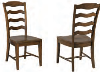
161-636 Renner Side Chair W19-3/4 D24 H43 Wood seat and back Seat height: 18-1/2 Seat depth: 19 Pages: 16/17, 18/19