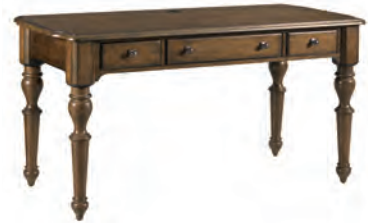
161-940 Corso Desk W60 D28 H31

3 inch riser block included for adjusting height Pages: 28/29, 30