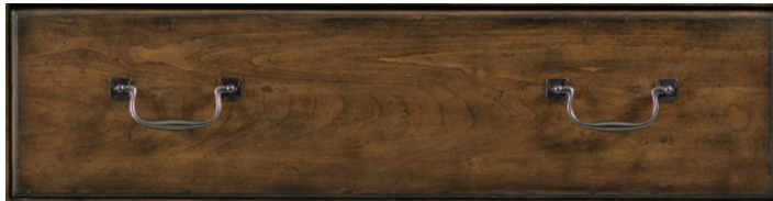
Rich Hazelnut finish

Kincaid’s dovetail drawer construction (front & back) uses the very best dovetail for each application.