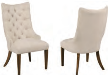
161-620 Higgins Upholstered Host Chair W23-1/4 D25-3/4 H42 Upholstered seat and back Seat height: 19 Seat depth: 18-3/4 Pages: 16/17, 18/19, 22/23