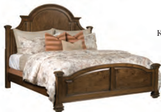
King bed shown