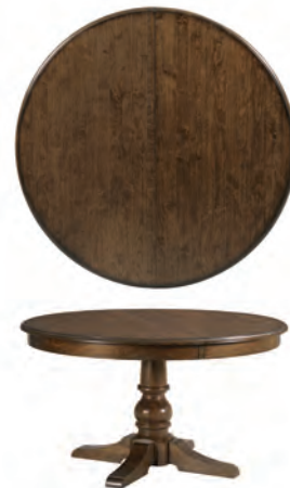
161-701P Byron Round Dining Table W54 D54 H30 Adjustable levelers, One 20" leaf

Consists of: 161-701 Byron Round Dining Top W54 D54 H4