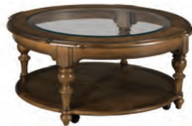
161-911 Corso Round Coffee Table W44 D44 H19

Casters, wood shelf, two drawers Pages: 28/29