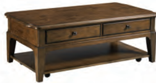
161-910 Washburn Rectangular Coffee Table W52 D28 H19

Casters, wood shelf, two drawers Pages: 28/29